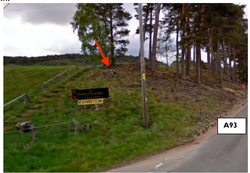
Fig. 4: Example of walking route on northern side of A93

special qualities of the National Park, across relatively level, easy walking terrain.