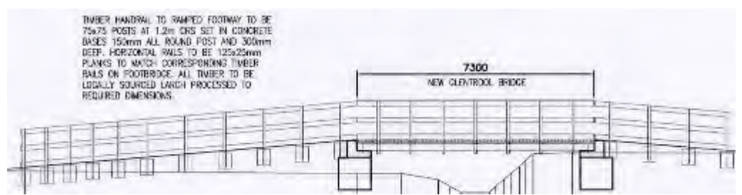
Fig. 2: Proposed elevations - 'Glentrool' type footbridge